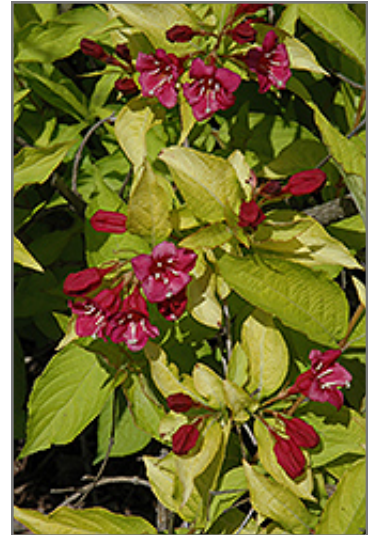
Rubidor Weigela flowers

Rubidor Weigela is recommended for the following landscape applications;