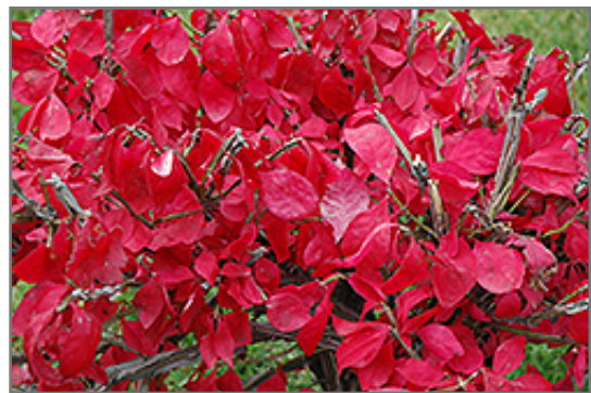
Compact Winged Burning Bush in fall