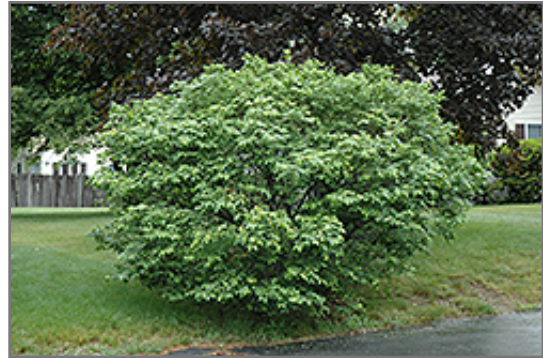
Compact Winged Burning Bush

Compact Winged Burning Bush will grow to be about 7 feet tall at maturity, with a spread of 7 feet. It tends to fill out right to the ground and therefore doesn't necessarily require facer plants in front, and is suitable for planting under power lines. It grows at a slow rate, and under ideal conditions can be expected to live for 50 years or more.