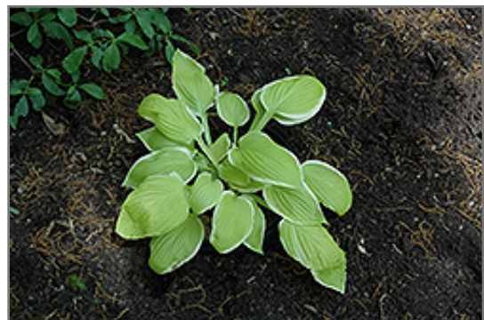
St. Elmo's Fire Hosta