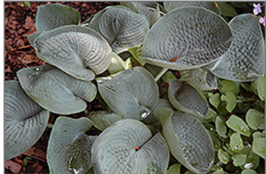
Abiqua Drinking Gourd Hosta foliage