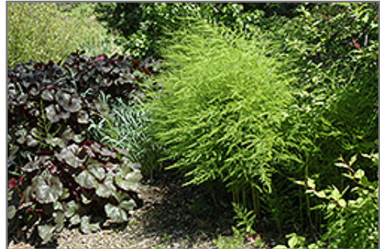
Mary Washington Asparagus

This plant is typically grown in a designated vegetable garden. It does best in full sun to partial shade. It does best in average to evenly moist conditions, but will not tolerate standing water. It is not particular as to soil pH, but grows best in rich soils. It is somewhat tolerant of urban pollution. This particular variety is an interspecific hybrid, and it is considered by many to be an heirloom variety.