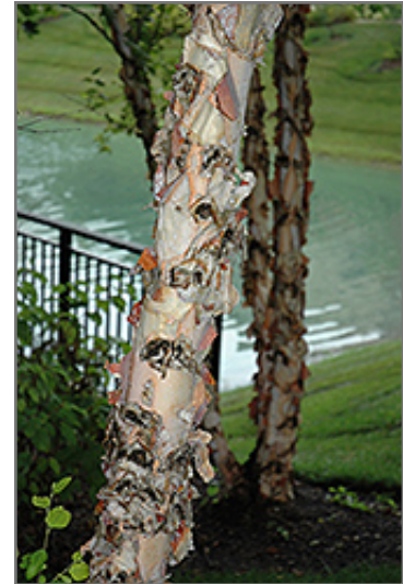
River Birch bark