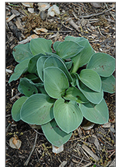
Blue Mouse Ears Hosta