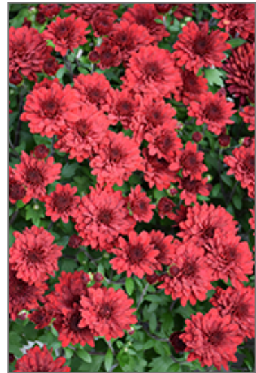
Five Alarm Red Chrysanthemum flowers