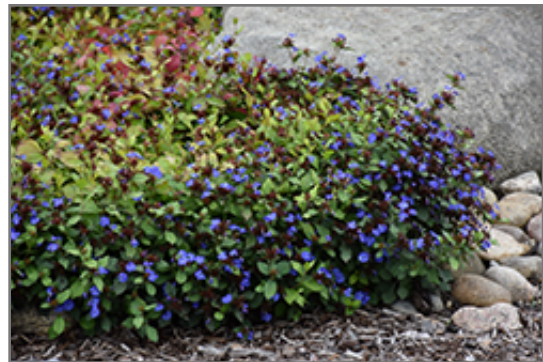
Plumbago in bloom