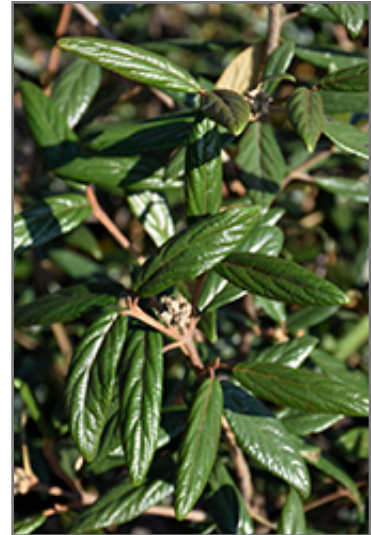
Prague Viburnum foliage

This shrub does best in full sun to partial shade. It prefers to grow in average to moist conditions, and shouldn't be allowed to dry out. It is not particular as to soil type or pH. It is highly tolerant of urban pollution and will even thrive in inner city environments. This particular variety is an interspecific hybrid.