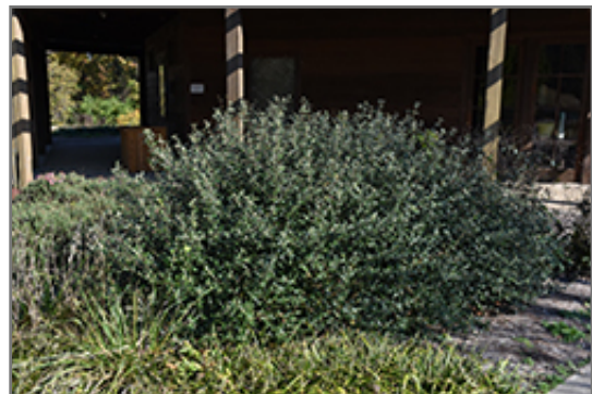
Prague Viburnum