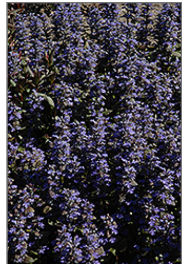
Purple Brocade Bugleweed flowers