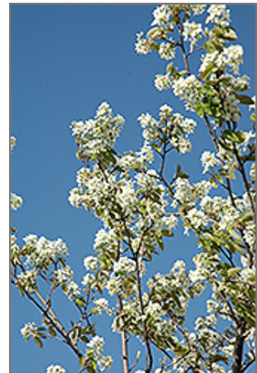
Allegheny Serviceberry flowers