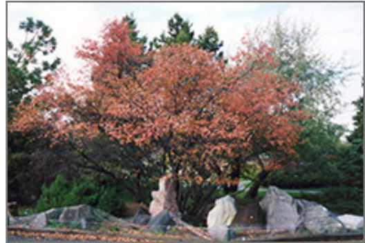
Allegheny Serviceberry in fall

This tree does best in full sun to partial shade. It prefers to grow in average to moist conditions, and shouldn't be allowed to dry out. It is not particular as to soil type or pH. It is somewhat tolerant of urban pollution. This species is native to parts of North America.