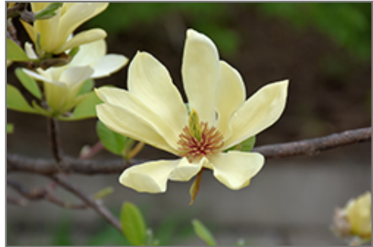
Butterflies Magnolia flowers