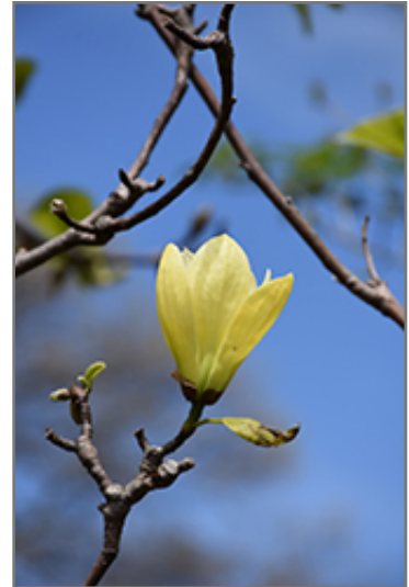
Butterflies Magnolia flowers

This tree does best in full sun to partial shade. It requires an evenly moist well-drained soil for optimal growth, but will die in standing water. It is not particular as to soil type, but has a definite preference for acidic soils. It is quite intolerant of urban pollution, therefore inner city or urban streetside plantings are best avoided. Consider applying a thick mulch around the root zone in winter to protect it in exposed locations or colder microclimates. This particular variety is an interspecific hybrid.