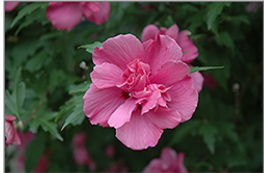
Lucy Rose Of Sharon flowers