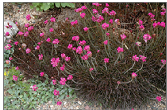
Red-leaved Sea Thrift in bloom