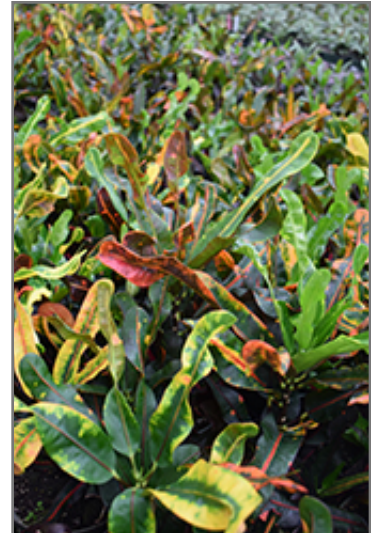
Mammy Croton in full

This is a dense herbaceous evergreen houseplant with an upright spreading habit of growth. Its wonderfully bold, coarse texture is quite ornamental and should be used to full effect. This plant should not require much pruning, except when necessary to keep it looking its best.