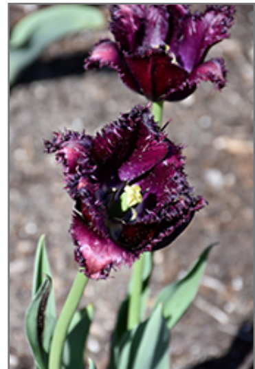
Black Parrot Tulip flowers