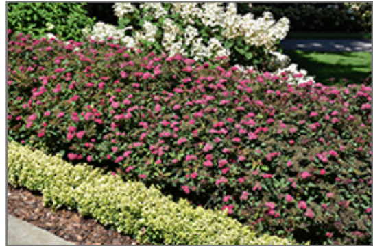
Double Play Doozie Spirea in bloom

This shrub will require occasional maintenance and upkeep, and is best pruned in late winter once the threat of extreme cold has passed. It is a good choice for attracting butterflies to your yard, but is not particularly attractive to deer who tend to leave it alone in favor of tastier treats. It has no significant negative characteristics.