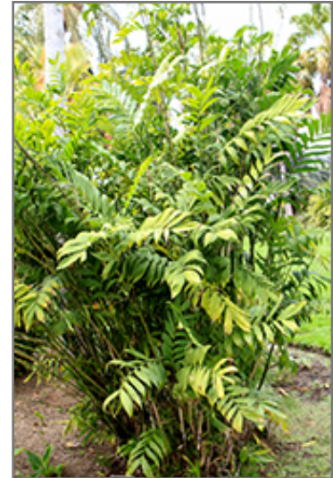
Hardy Bamboo Palm

When grown indoors, Hardy Bamboo Palm can be expected to grow to be about 6 feet tall at maturity, with a spread of 3 feet. It grows at a slow rate, and under ideal conditions can be expected to live for approximately 10 years. This houseplant performs well in both bright or indirect sunlight and strong artificial light, and can therefore be situated in almost any well-lit room or location. It is very adaptable to both dry and moist soil, but will not tolerate any standing water. The surface of the soil shouldn't be allowed to dry out completely, and so you should expect to water this plant once and possibly even twice each week. Be aware that your particular watering schedule may vary depending on its location in the room, the pot size, plant size and other conditions; if in doubt, ask one of our experts in the store for advice. It is not particular as to soil pH, but grows best in rich soil. Contact the store for specific recommendations on pre-mixed potting soil for this plant.