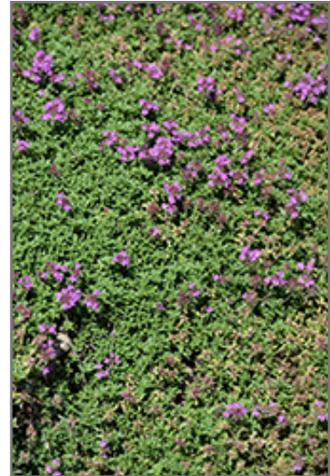
Creeping Thyme in bloom

Creeping Thyme is recommended for the following landscape applications;