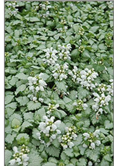
White Nancy Spotted Dead Nettle flowers