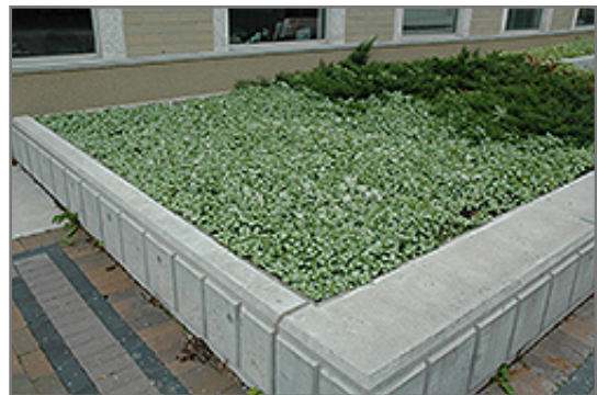
White Nancy Spotted Dead Nettle in bloom