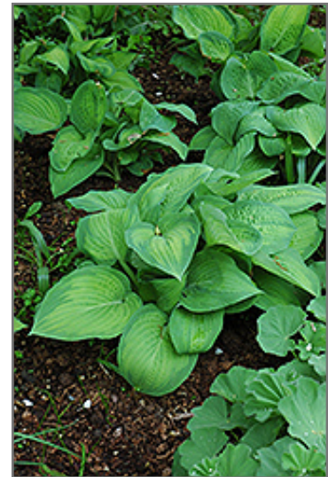
Paul's Glory Hosta