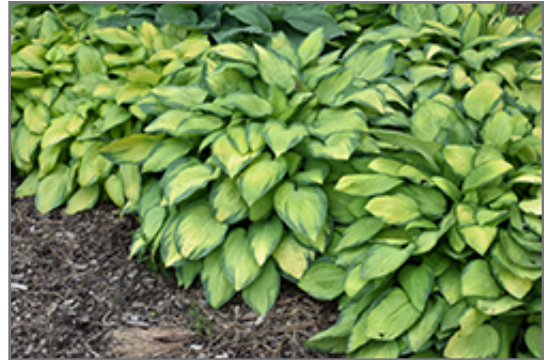
Paul's Glory Hosta

Paul's Glory Hosta is recommended for the following landscape applications;