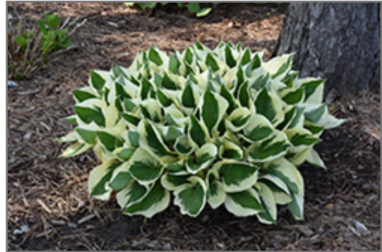
Patriot Hosta