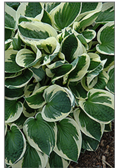
Patriot Hosta foliage