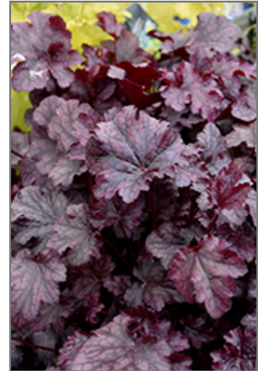
Plum Pudding Coral Bells foliage

Plum Pudding Coral Bells is recommended for the following landscape applications;