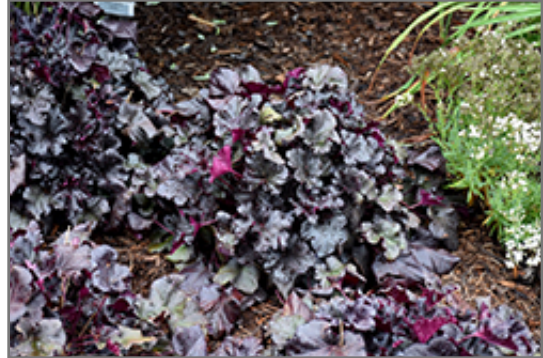
Black Pearl Coral Bells

Black Pearl Coral Bells will grow to be about 10 inches tall at maturity extending to 20 inches tall with the flowers, with a spread of 26 inches. When grown in masses or used as a bedding plant, individual plants should be spaced approximately 20 inches apart. Its foliage tends to remain low and dense right to the ground. It grows at a medium rate, and under ideal conditions can be expected to live for approximately 10 years. As an evergreen perennial, this plant will typically keep its form and foliage year-round.