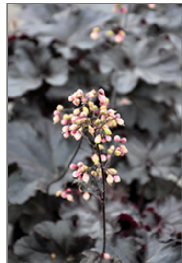
Black Pearl Coral Bells flowers