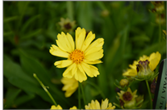
Leading Lady Sophia Tickseed flowers