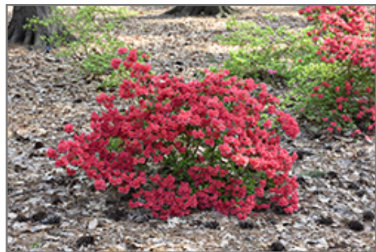
Girard's Crimson Azalea in bloom