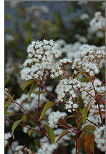
Chocolate Boneset flowers

Chocolate Boneset is recommended for the following landscape applications;