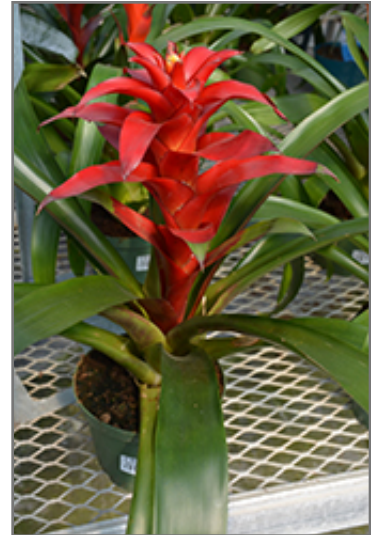
Brimstone Guzmania Bromeliad flowers

There are many factors that will affect the ultimate height, spread and overall performance of a plant when grown indoors; among them, the size of the pot it's growing in, the amount of light it receives, watering frequency, the pruning regimen and repotting schedule. Use the information described here as a guideline only; individual performance can and will vary. Please contact the store to speak with one of our experts if you are interested in further details concerning recommendations on pot size, watering, pruning, repotting, etc.