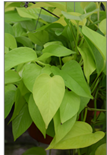
Neon Pothos foliage