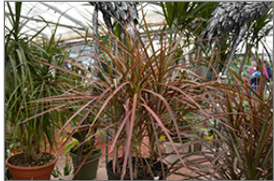
Tricolor Dracaena