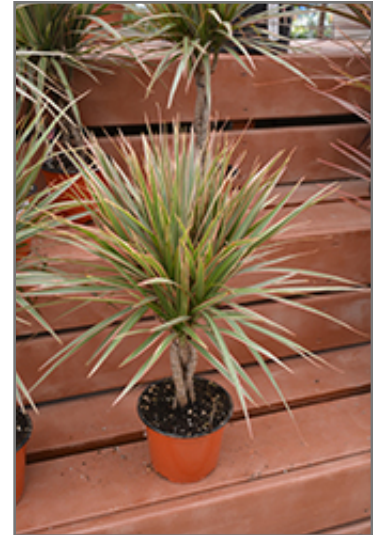
Colorama Dracaena in full

When grown indoors, Colorama Dracaena can be expected to grow to be about 3 feet tall at maturity, with a spread of 24 inches. It grows at a medium rate, and under ideal conditions can be expected to live for approximately 10 years. This houseplant performs well in both bright or indirect sunlight and strong artificial light, and can therefore be situated in almost any well-lit room or location. It does best in average to evenly moist soil, but will not tolerate standing water. The surface of the soil shouldn't be allowed to dry out completely, and so you should expect to water this plant once and possibly even twice each week. Be aware that your particular watering schedule may vary depending on its location in the room, the pot size, plant size and other conditions; if in doubt, ask one of our experts in the store for advice. It is not particular as to soil type or pH; an average potting soil should work just fine.