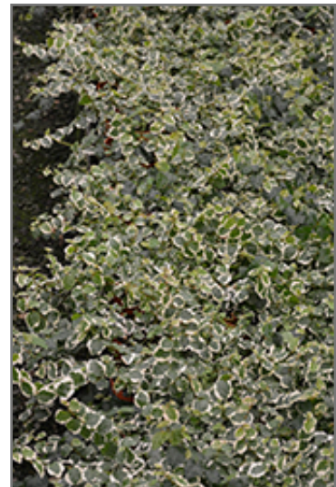
Variegated Creeping Fig in full