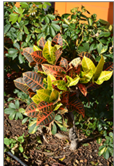
Variegated Croton