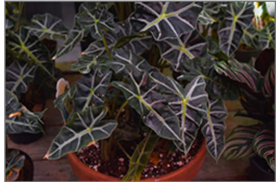
Amazon Elephant's Ear foliage

Other Names: African Mask, Alligator Plant