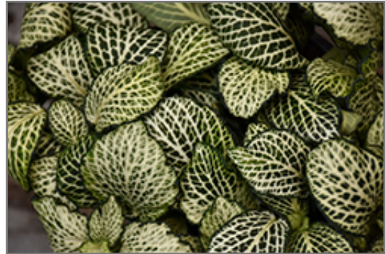
Mosaic Plant foliage

When grown indoors, Mosaic Plant can be expected to grow to be about 10 inches tall at maturity, with a spread of 15 inches. It grows at a slow rate, and under ideal conditions can be expected to live for approximately 10 years. This houseplant performs well in both bright or indirect sunlight and strong artificial light, and can therefore be situated in almost any well-lit room or location. It prefers to grow in average to moist soil. The surface of the soil shouldn't be allowed to dry out completely, and so you should expect to water this plant once and possibly even twice each week. Be aware that your particular watering schedule may vary depending on its location in the room, the pot size, plant size and other conditions; if in doubt, ask one of our experts in the store for advice. It is not particular as to soil type or pH; an average potting soil should work just fine.