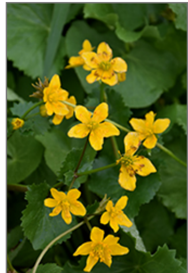
Marsh Marigold flowers