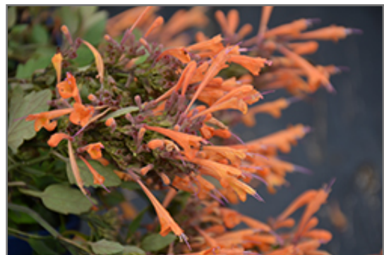
Kudos Mandarin Hyssop flowers