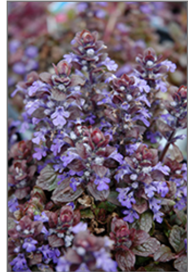
Bronze Beauty Bugleweed flowers

Bronze Beauty Bugleweed is recommended for the following landscape applications;