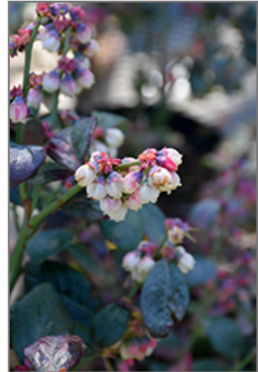
Pink Icing Blueberry flowers

This shrub is quite ornamental as well as edible, and is as much at home in a landscape or flower garden as it is in a designated edibles garden. It does best in full sun to partial shade. It does best in average to evenly moist conditions, but will not tolerate standing water. It is very fussy about its soil conditions and must have sandy, acidic soils to ensure success, and is subject to chlorosis (yellowing) of the foliage in alkaline soils. It is quite intolerant of urban pollution, therefore inner city or urban streetside plantings are best avoided, and will benefit from being planted in a relatively sheltered location. Consider applying a thick mulch around the root zone in winter to protect it in exposed locations or colder microclimates. This particular variety is an interspecific hybrid.