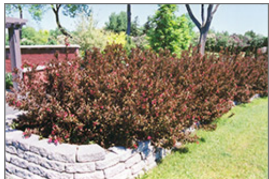
Wine and Roses Weigela