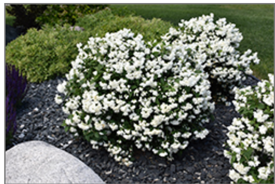
Snowbelle Mockorange in bloom