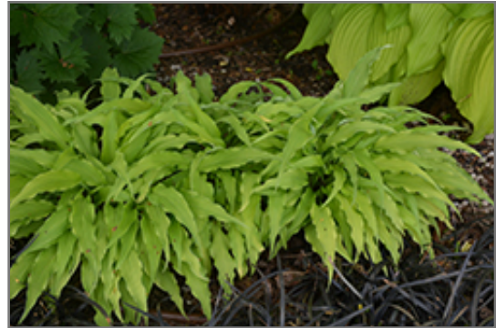
Curly Fries Hosta

Curly Fries Hosta will grow to be only 6 inches tall at maturity extending to 16 inches tall with the flowers, with a spread of 16 inches. When grown in masses or used as a bedding plant, individual plants should be spaced approximately 12 inches apart. Its foliage tends to remain low and dense right to the ground. It grows at a slow rate, and under ideal conditions can be expected to live for approximately 10 years. As an herbaceous perennial, this plant will usually die back to the crown each winter, and will regrow from the base each spring. Be careful not to disturb the crown in late winter when it may not be readily seen!