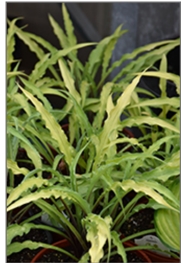
Curly Fries Hosta foliage