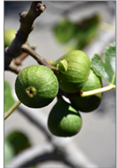
Chicago Hardy Fig fruit

Chicago Hardy Fig has attractive dark green foliage with chartreuse veins on a tree with a round habit of growth. The lobed leaves are highly ornamental but do not develop any appreciable fall color. The fruits are showy plum purple pomes carried in abundance in mid fall. The fruit can be messy if allowed to drop on the lawn or walkways, and may require occasional clean-up.