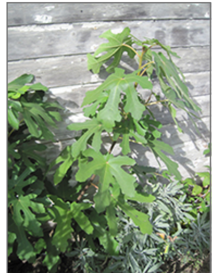
Chicago Hardy Fig flowers