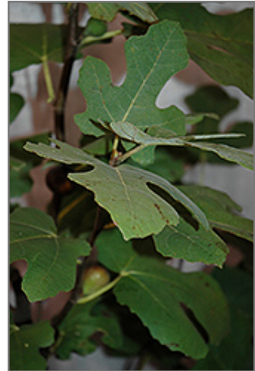
Chicago Hardy Fig foliage

Chicago Hardy Fig is a good choice for the edible garden, but it is also well-suited for use in outdoor pots and containers. Because of its height, it is often used as a 'thriller' in the 'spiller-thriller-filler' container combination; plant it near the center of the pot, surrounded by smaller plants and those that spill over the edges. It is even sizeable enough that it can be grown alone in a suitable container. Note that when grown in a container, it may not perform exactly as indicated on the tag - this is to be expected. Also note that when growing plants in outdoor containers and baskets, they may require more frequent waterings than they would in the yard or garden.