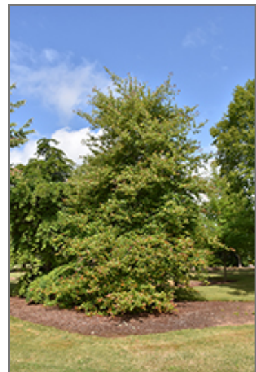
Wildfire Black Gum