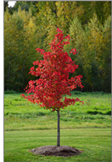
Wildfire Black Gum in fall