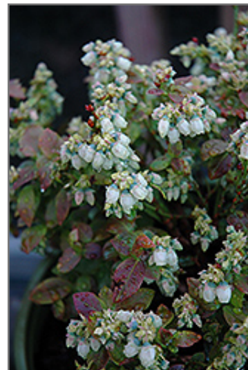
Jelly Bean Blueberry flowers

Jelly Bean Blueberry is a good choice for the edible garden, but it is also well-suited for use in outdoor pots and containers. It can be used either as 'filler' or as a 'thriller' in the 'spiller-thriller-filler' container combination, depending on the height and form of the other plants used in the container planting. It is even sizeable enough that it can be grown alone in a suitable container. Note that when grown in a container, it may not perform exactly as indicated on the tag - this is to be expected. Also note that when growing plants in outdoor containers and baskets, they may require more frequent waterings than they would in the yard or garden.