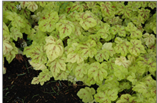
Yellowstone Falls Foamy Bells foliage