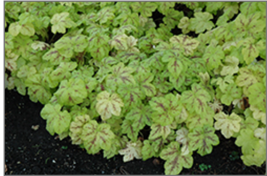
Yellowstone Falls Foamy Bells

Yellowstone Falls Foamy Bells is recommended for the following landscape applications;