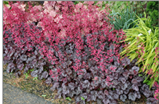
Glitter Coral Bells in bloom

Glitter Coral Bells is recommended for the following landscape applications;