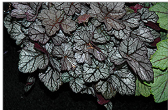
Glitter Coral Bells foliage