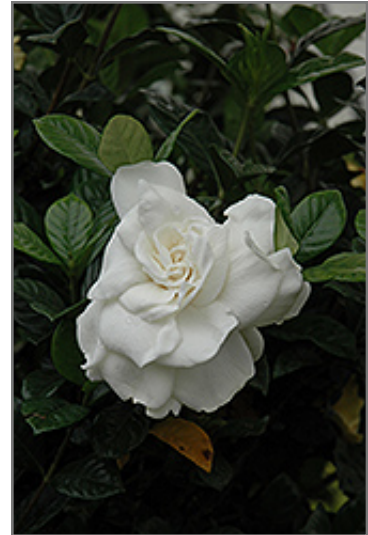
Gardenia (tree form) flowers