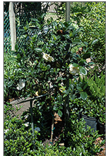
Gardenia (tree form) in bloom