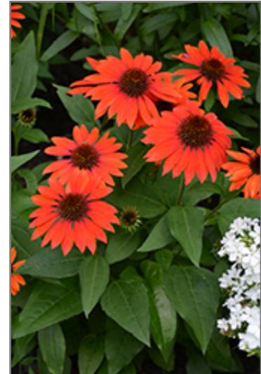
Sombrero Flamenco Orange Coneflower in bloom

Sombrero Flamenco Orange Coneflower is recommended for the following landscape applications;